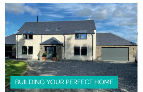
BUILDING YOUR PERFECT HOME